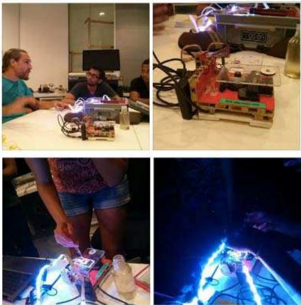
Figure 1. Hackteria.org workshop on DIY microfluidics at Andreas Schlegel's lab in Lasalle college of Arts in Singapore.

The OSHW as a medium of connecting emergent scientific practices (microfluidics and biochips) with crafts was used in series of workshops in 2014 in Singapore, Yogyakarta and Montreal, where we reiterated a prototype for a "Wayang kulit microfluidic shadow theater". We employed folklore and traditional crafts (wayang theater) to create a media archeology prototype of a wayang kulit microfluidic shadow puppets with magnetic particles, but also zooplankton. While the early (April 2014) prototype concentrated on the puppetry aspects, the later prototype (September 2014) researched the use of traditional materials and techniques employed in gamelan music instrument making. While in the early prototype (see Figure 1), we were trying to identify the right materials for microfluidic interaction simulating wayang kulit puppets and movements, in the later reiteration (see Figure 2), we concentrated on the shape of the whole object and its functionality. The wayang kulit microfluidics theater also references the early media history behind zoopraxiscope and early devices displaying motions of organisms, which enabled modern cinema. With this object we are exploring the artistic potential of emergent microfluidic devices as well as their ability to communicate science through wayang kulit and gamelan performances.